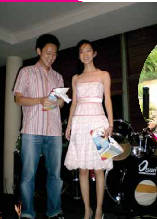
Mr and Ms Dentistry